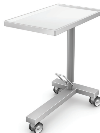
Option: a table equipped with double castors of 100 mm diameter