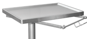
E-01KO with a removable top